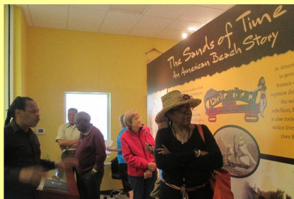
Learning more about local history is really fun!