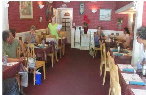
May - Luncheon time sharing winning essay from student.