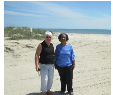
April - American Beach Fun!