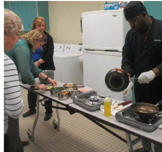
February - yum omelet's to order!