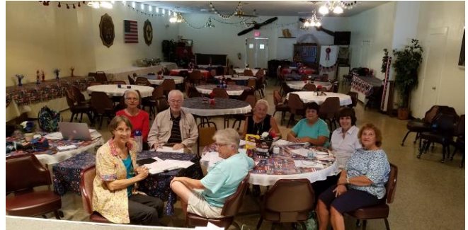
September board meeting showing our new much roomier meeting place.