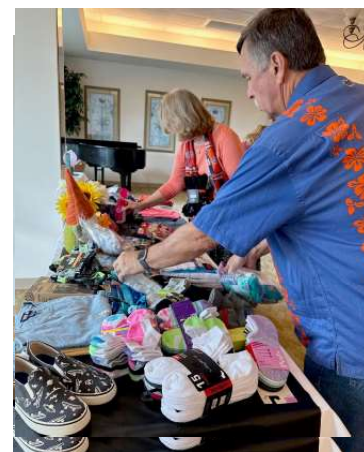
Clothes to Kids donations

We collected a large tableful of socks and shoes, underwear, t-shirts, and shorts for Clothes to Kids to distribute to needy students as they went back to school in September.